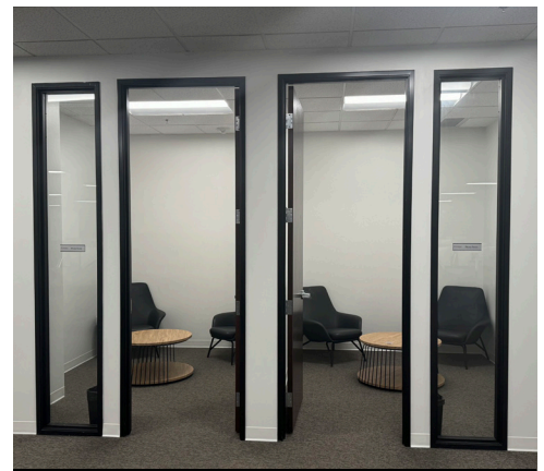
4 Phone Rooms