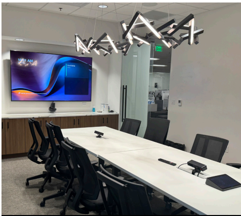
12-Person Conference Room