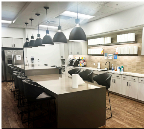
Large Break Room with Seating, 2-Refrigerators/Microwaves