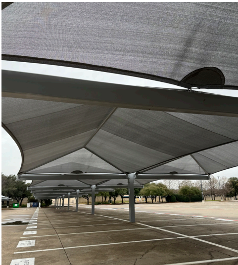
92 Covered Reserved Parking Spaces