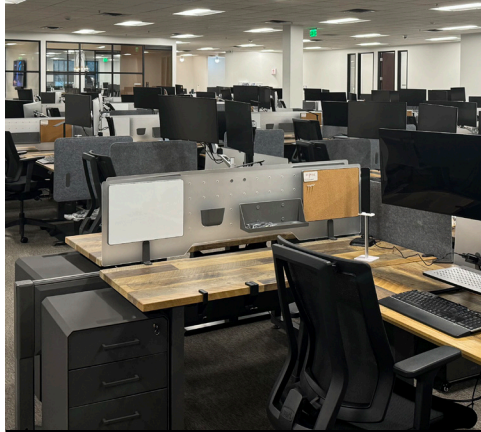
Bullpen w/Varidesk Standing Desks